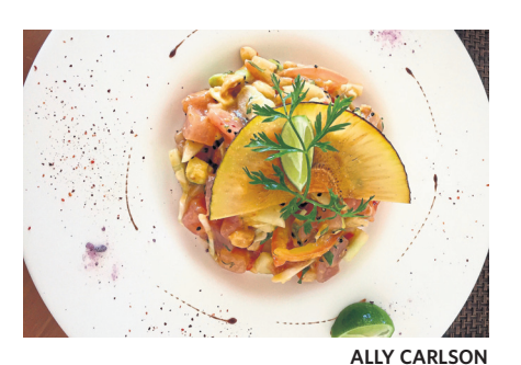
Have tuna tartare on a motu: Yellowfin tuna is served everywhere (as tartare, poke, carpaccio and sashimi), and it's about as fresh as it gets.

Taking the 40-minute ferry ride from Papeete to Moorea, it's hard not to feel a sense of awe as the island comes into view, with its lush, jagged mountains shrouded in mist, towering over turquoise lagoons fringed by coral reefs.