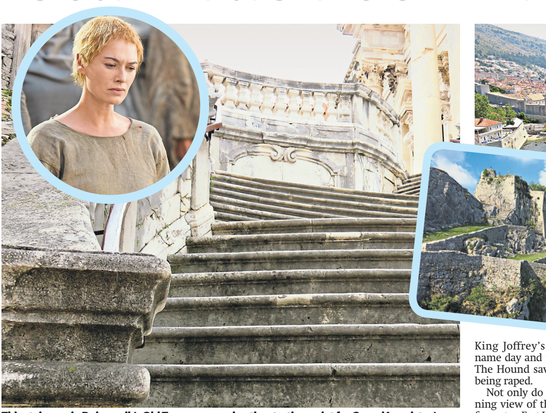
This staircase in Dubrovnik's Old Town was used as the starting point for Cersei Lannister's walk of shame on the season five finale of Game of Thrones

But it's more than that. Sure, there's a lot of CGI in GoT like dragons, White Walkers and such — but it wasn't hard